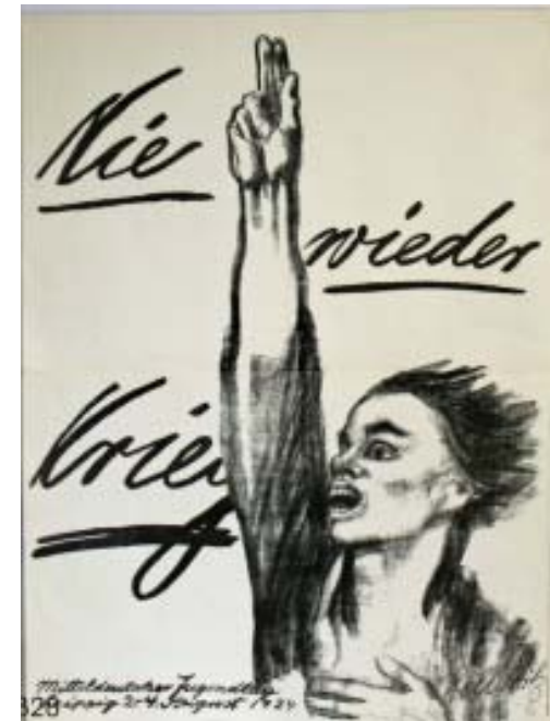
Käthe Kollwitz, Nie wieder Krieg, vor August 1924, Käthe Kollwitz Museum Köln